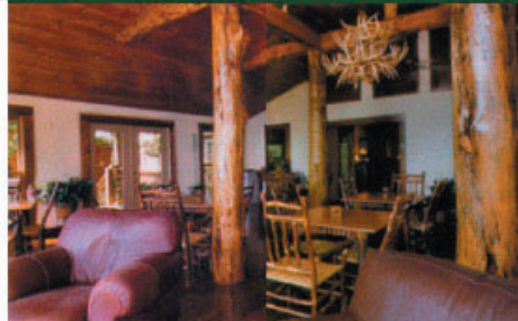
above: The inn's living room sports a Western lodge motif. left: Mountain laurel branches cut from the site form an interesting banister in one of the cabins.

They accumulated 150 ridgetop acres at the edge of Chattahoochee National Forest, quit their Atlanta jobs, and moved to the mountain full-time. The couple now runs the six-guest room Overlook Inn as